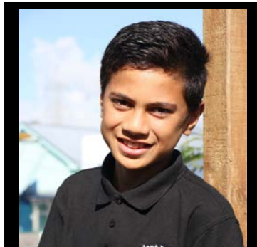
Meet Junior he wears a BLACK shirt