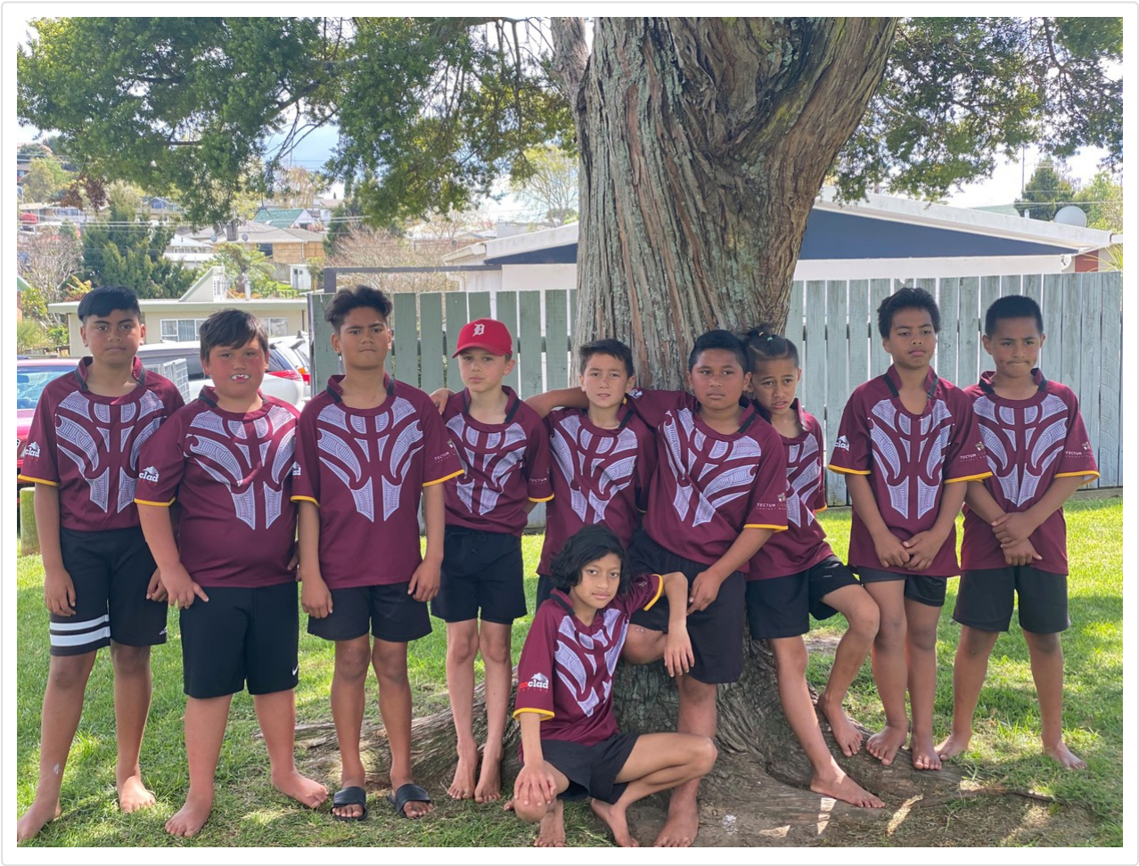
Our amazing Team Representing GVS today at the Kakahu Pekepeke Tournament at Mitchell Park